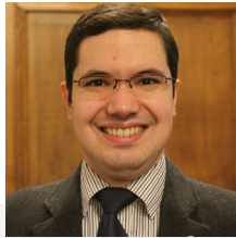
District 91* Florian Bay, DTM United Kingdom